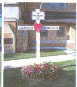
St Joseph the Worker Gary, Ind.