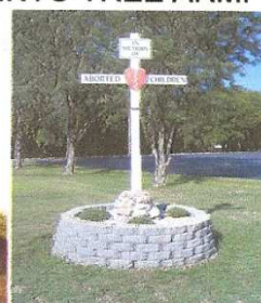
St Joan Of Arc Merrillville, Ind.